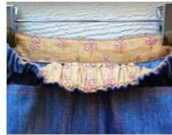
WAISTBAND PRINTED FABRICS