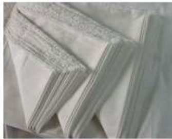
WHITE POCKETING FABRICS