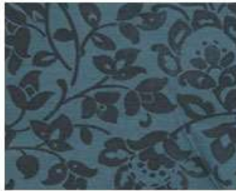
PRINTED POCKETING FABRICS