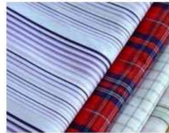
YARN DYED POCKETING FABRICS