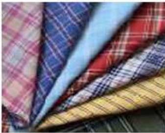
WAISTBAND YARN DYED FABRICS